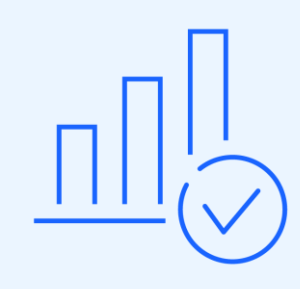
Market share of around 50%*